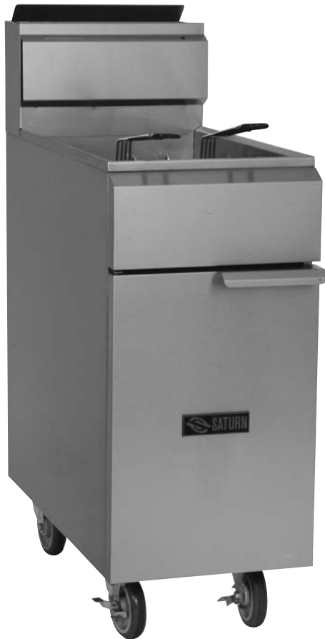
MODEL# 500-FRF-50 (Shown with optional casters)